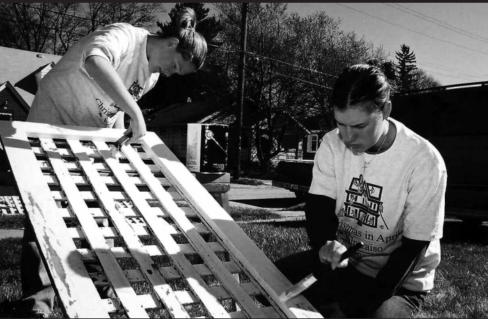
The Guild provided a $5,000 grant for Valpo students to attend a Spring Break Habitat for Humanity trip.

"The Guild is a wonderful way to have friends with a love for Valpo in common, regardless of when they graduated or their affiliation."