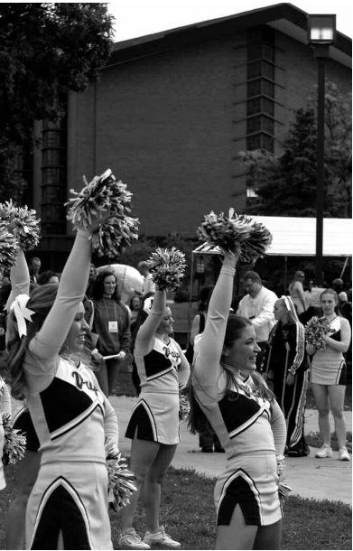
Guild members care about students' well-being.

For the brief time while these students are enrolled at Valparaiso University, the Guild provides a variety of resources so students can begin to contribute to the world in dynamic ways.